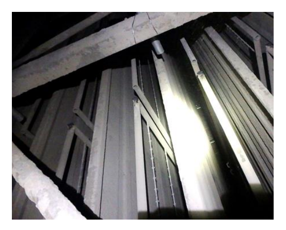
Original DEs and its frame