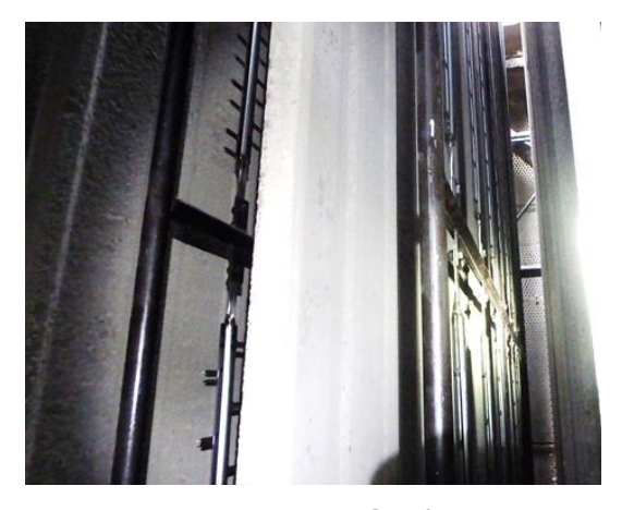
New RDEs and its frame